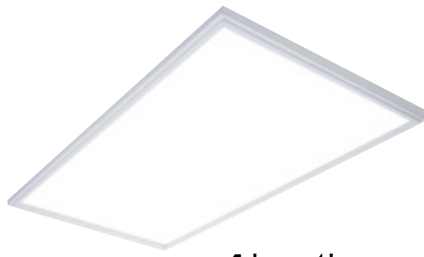
1' x 4'