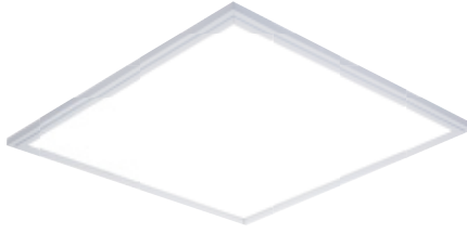
2' x 2'