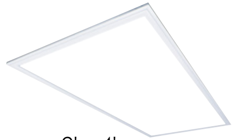
2' x 4'