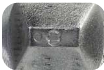
Unique 444S Crimp Embossment

See Expanded Range details in Reference Section