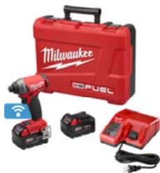
M18 FUEL™ with ONE-KEY™ 1/4" Hex Impact Driver Kit

(/Products/Power-Tools/Fastening/Impact-Drivers/2757-22)