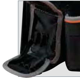
Drill bit pocket