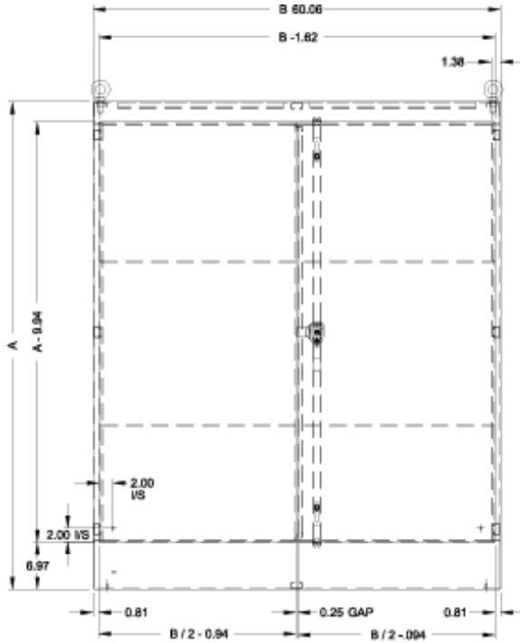
Single or Dual Access - Front View