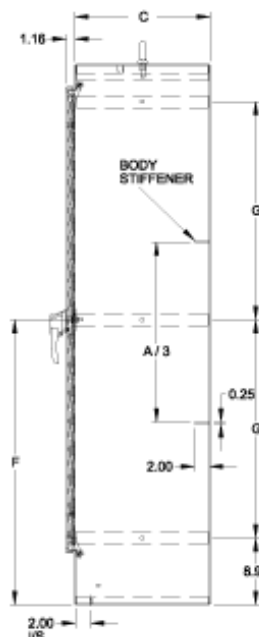
Single Access - Side View