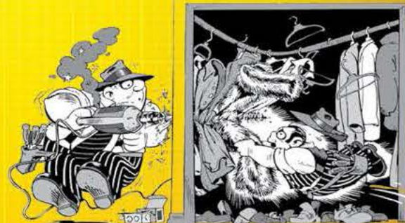
NEED A NEW FILLER KIT? CHECK OUT OUR BACK PAGE FOR OUR NEW SEARCH SERVICE