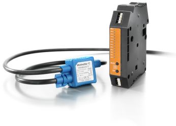
use with Rogowski coil