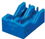
45-524 Blue Replacement Cartridge

Belden® is a registered trademark of Belden Technologies, Inc.