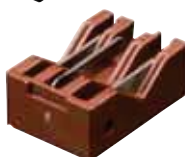
45-523 Brown Replacement Cartridge