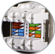
T568A/B wiring schemes