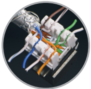
Wires held in place