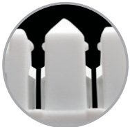
Blades' locking mechanism