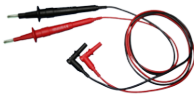
TLF-002 1000V CAT III Leads with large angle plug