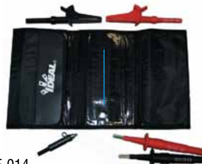
TLF-014 CAT IV Custom Kit Kit Contains: 1kV Cat IV Probes with Shuttered Spike, 1kV Alligator Clips, Lead/Fuse Tester and Four-Pocket Tool Roll Organizer