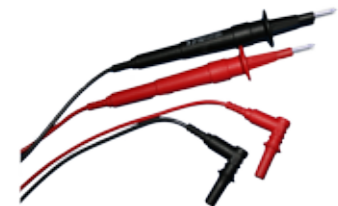
TLF-004 1000V CAT IV Leads