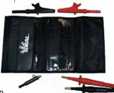
TLF-013 CAT III Custom Kit Kit Contains: 1kV Cat III Probes with Shuttered Spike, 1kV Alligator Clips, Lead/Fuse Tester and Four-Pocket Tool Roll Organizer