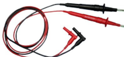
TLF-003 1000V CAT III Leads