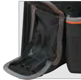
Drill bit pocket