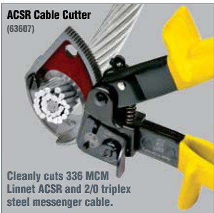
ACSR Cable Cutter (63607)

Cleanly cuts 336 MCM Linnet ACSR and 2/0 triplex steel messenger cable.