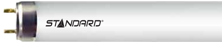
Nominal length : 48 in. (915 mm) Dia. : 1 in. (26 mm)

Order code: 65490 Description: F28T8/841HL/ES UPC: 69549654907 Case quantity: 25