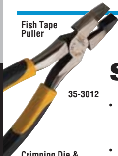
Fish Tape Puller