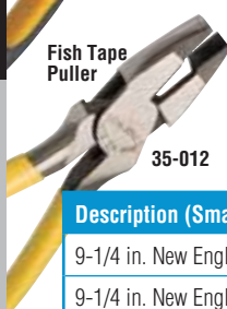
Fish Tape Puller