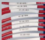
PermaSleeve® Wire Marking Sleeves