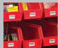
General ID ...and many more!