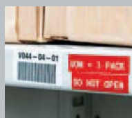
Facility & Safety Identification