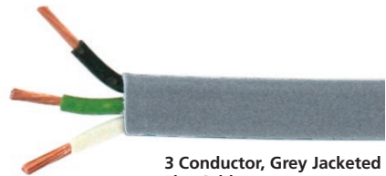
3 Conductor, Grey Jacketed Flat Cable