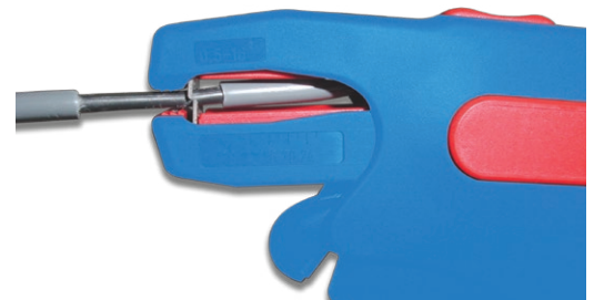
669963 Stripper for Flat & Round Type Wire/Cable

Part number 669963 can now be found on page 79