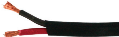
2 Conductor, Black Jacketed Flat Cable