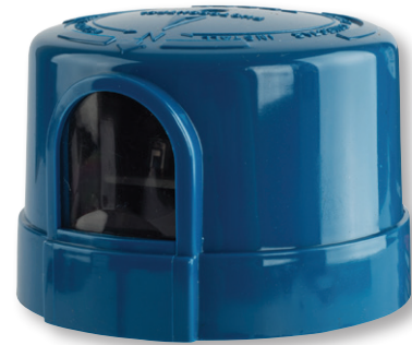
ZTL124-510J-LED Zero-Cross Electronic LED Photocontrol Mounting Turn-Lock