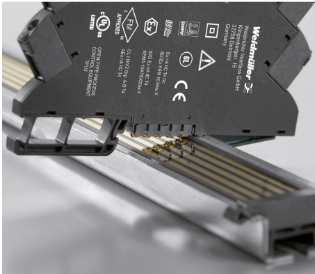
Additional power supply option via bus