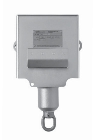
AFS mine signal switch