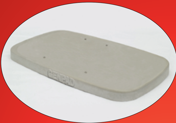
GenPad™ Designed for residential installation.