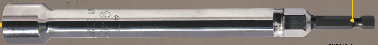
Available in 2", 5" and 10" lengths