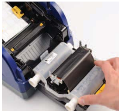
Installs in 3 seconds and the ink always faces the right direction!