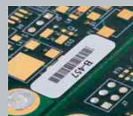
Circuit Board Materials