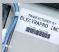
Industrial Barcode Labels