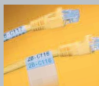
Voice & Data Communications