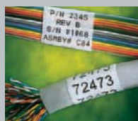
Wire & Cable Labeling