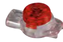
VDV826-605 3 wire (26-19 AWG)