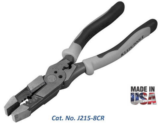
Cat. No. J215-8CR

With full length, induction hardened knives and a high-leverage design, these hybrid pliers provide more cutting power. It cleanly strips 10-14 AWG solid and 12-16 stranded wire. Convenient holes for bolt shearing plus a crimper for non-insulated connectors, lugs and terminals make this a must-have tool for any bag.