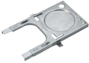
Utility Tray Part #99163 fits 6300, 6400, 6900 Series