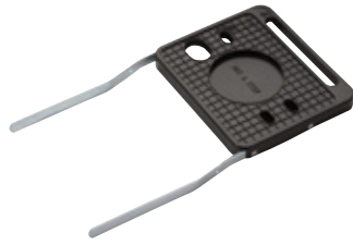
Utility Tray Part #99019 fits 2400 Series