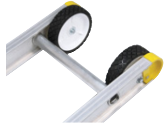
Wheels Part #99326