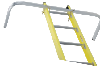
Wall Stand-off Part #WSO40