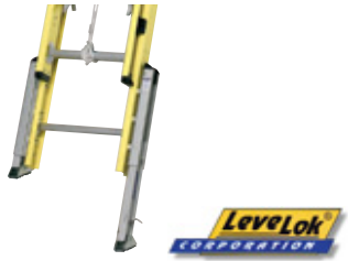
LEVELOK Leg Leveler Part #21145