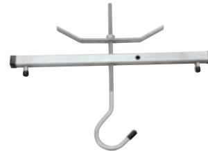
Roof Ladder Lock Part #99062