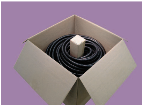
Polyethylene Split Loom – Bulk Box

Nylon Split Loom... For Applications up to 149°C (300°F)