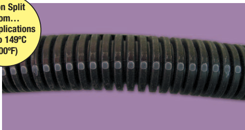
Nylon (High Temperature) Split Loom

Nylon Split Loom... For Applications up to 149°C (300°F)