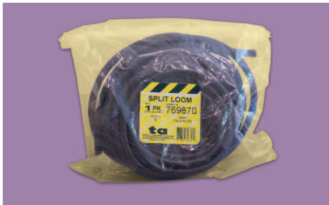
Split Loom Packaging – 50 ft Pack