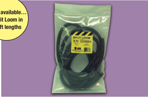
Polyethylene Split Loom Applications

Now available... Split Loom in 10ft lengths