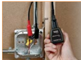
Alligator Clip Accessory