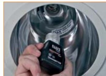
Light Socket Adapter

Designed by Electricians for Electricians