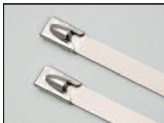
L-8250SSC 316 Stainless Steel 250.lb

** All 250 lb ball lock ties have been re-certified and UL Listed to 300 lb tensile strength