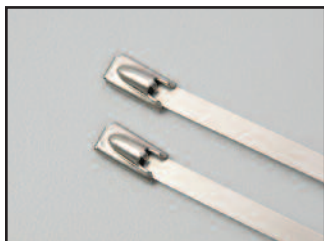
L-8150SSC 316 Stainless Steel 150.lb

Check with Customer Service for other sizes and availability.