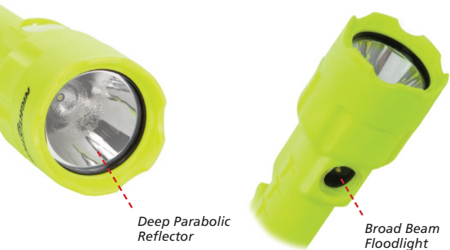
Deep Parabolic Reflector