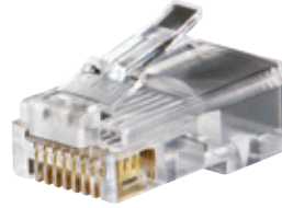
VDV826-628, VDV826-602, VDV826-611