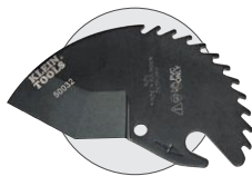
REPLACEMENT BLADE FOR 50031 50035