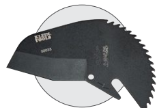
REPLACEMENT BLADE FOR 50034 50035