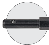
REPLACEMENT RETAINING PIN 50033