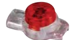
UR IDC VDV826-605 3 wire (26-19 AWG)