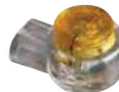
UY IDC VDV826-604 2 wire (26-22 AWG)