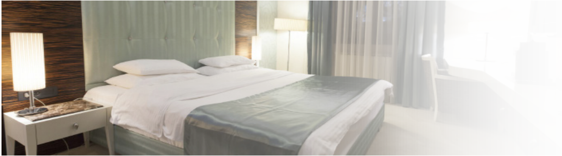
Application illustration only, subject lamps not used in photo.