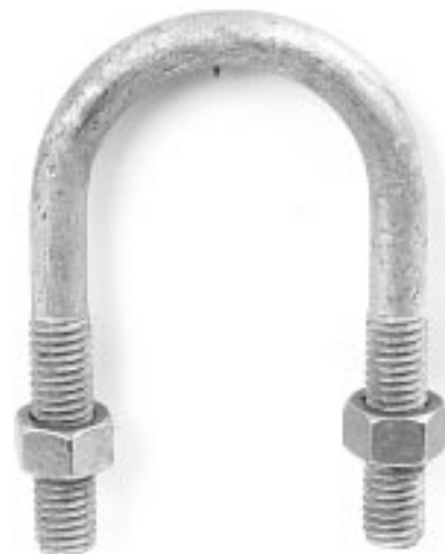
available in 3/8" or 5/16" diameter