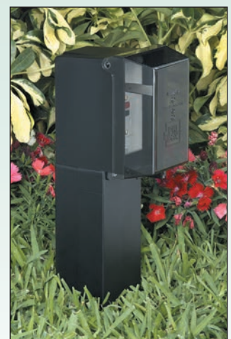
When you can have a great looking, long-lasting job like this!