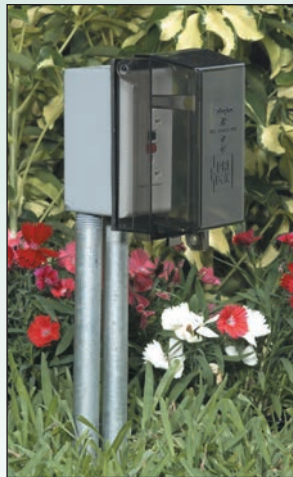
Why install boxes this way...