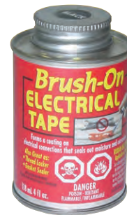
Liquid Electrical Tape