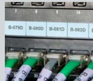
Patch Panel & Terminal Block ID