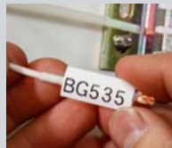
PermaSleeve® Wire Marking Sleeves