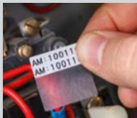
Wire & Cable Marking