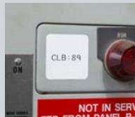
Asset & Equipment Identification