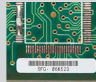
Circuit Board Identification