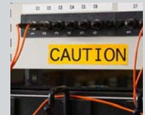
Facility & Safety ID ...and many more!