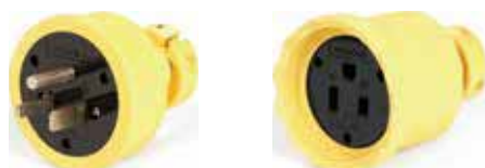
Super-Safeway Industrial Rubber Plug and Connector