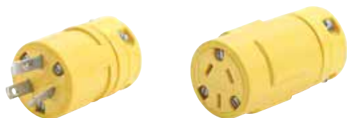
Super-Safeway Industrial Rubber Plug and Connector