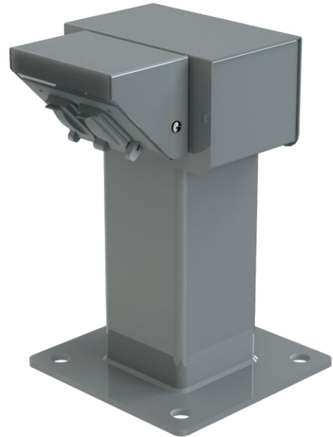
AP Short Series (12" High) Shown