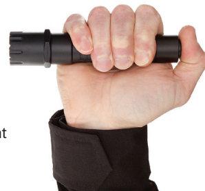
Push-button tactical tail-cap switch