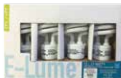
Paquet de 4