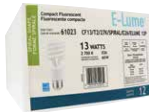
Paquet de 12